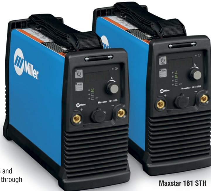
Maxstar 161 STL

Built-in gas solenoid eliminates the need for a bulky torch with a gas valve.